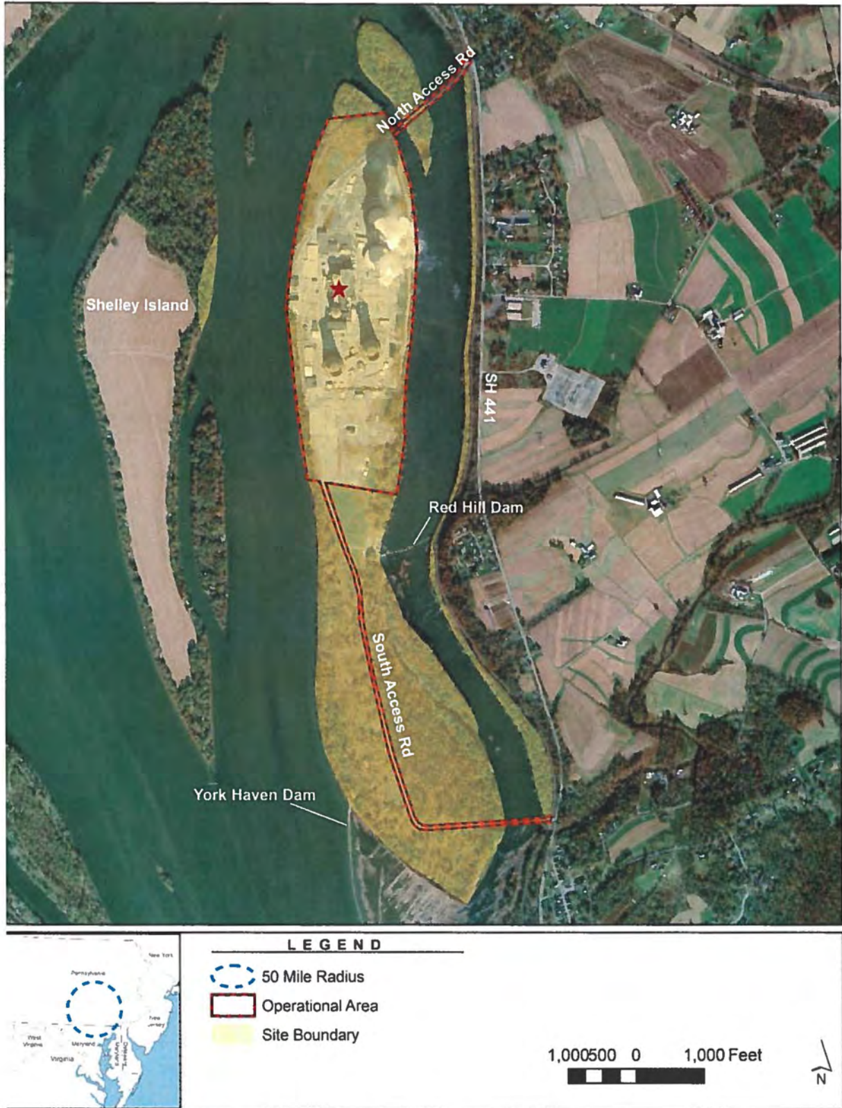
Figure 1 : TMI-1 Approximate Operational Area Boundary